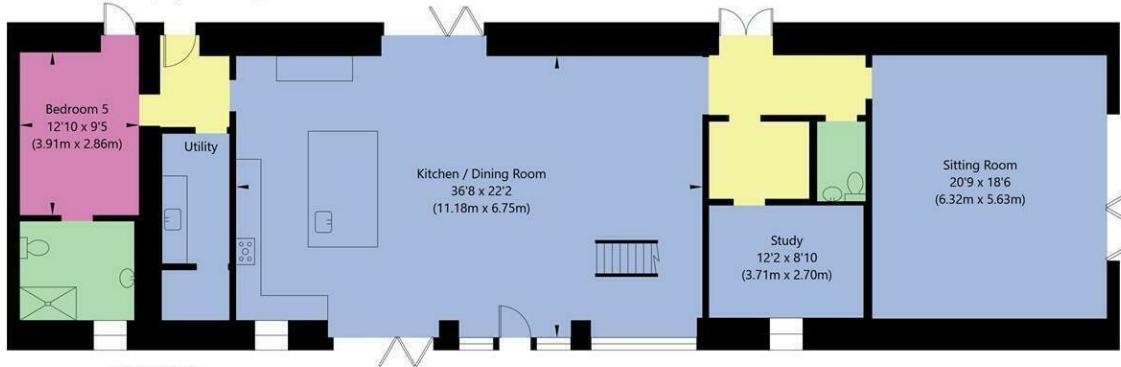
Ground Floor GROSS INTERNAL FLOOR AREA APPROX. 1848 SQ FT / 171.71 SQ M

NOT TO SCALE - FOR ILLUSTRATIVE PURPOSES ONLY APPROXIMATE GROSS INTERNAL FLOOR AREA 3357 SQ FT / 311.89 SQ M - (Excluding Voids) All measurements and fixtures including doors and windows are approximate and should be independently verified. www.exposurepropertymarketing.com © 2024